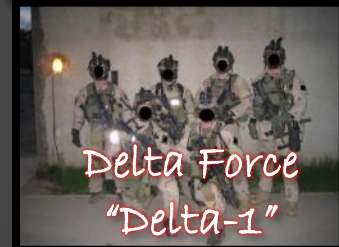
Delta Force "Delta-1"