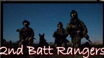
2nd Batt Rangers

Once confirmed all Delta Teams are on-board and given the approval of Delta-1, RV FOB Suse and await further tasking unless retasked by Higher HQs