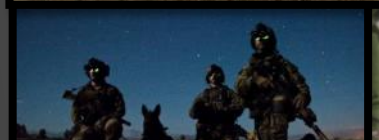
2nd Batt Rangers