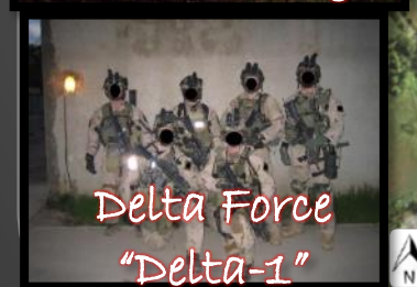
Delta Force "Delta-1"